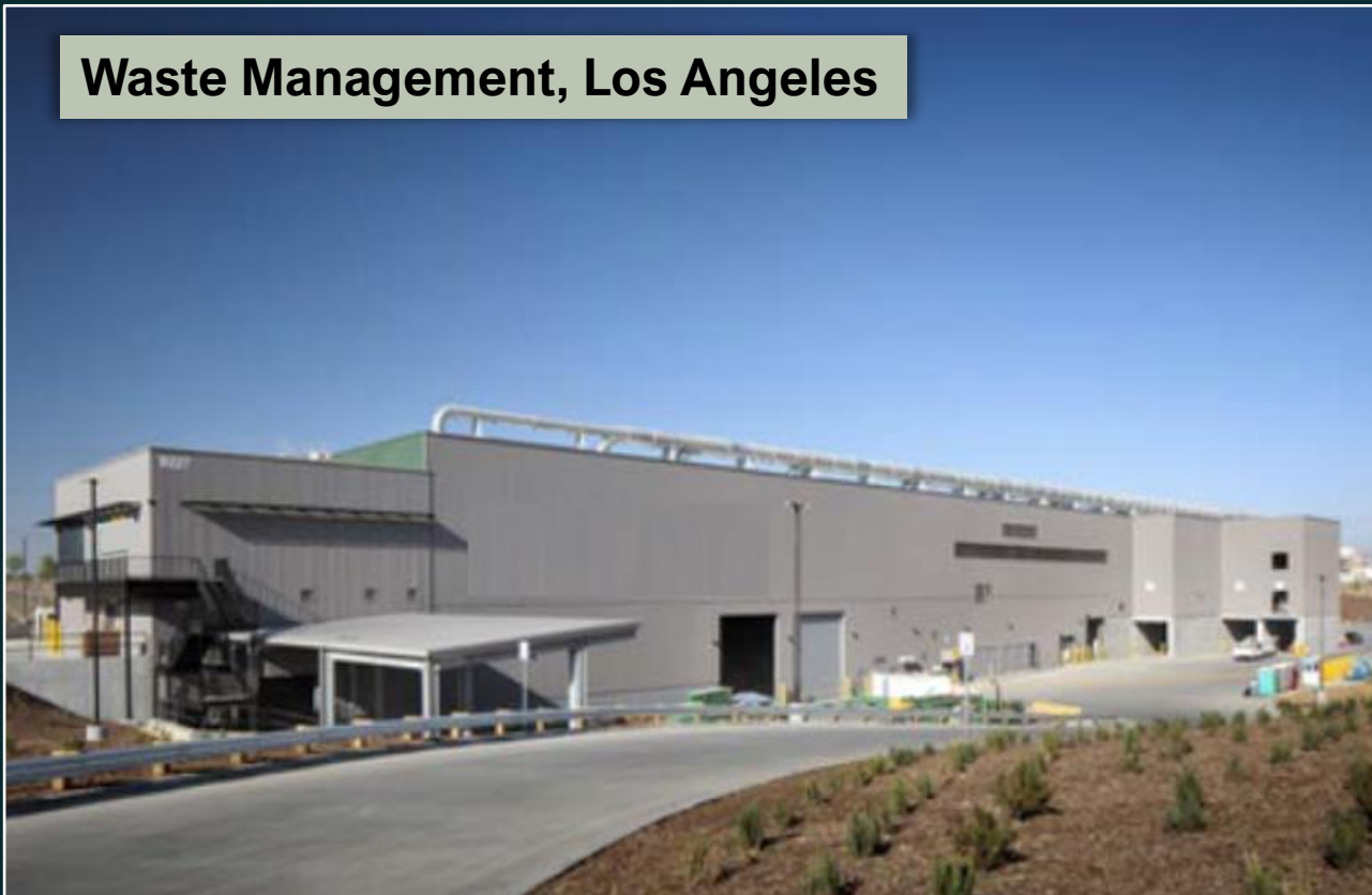
Waste Management, Los Angeles