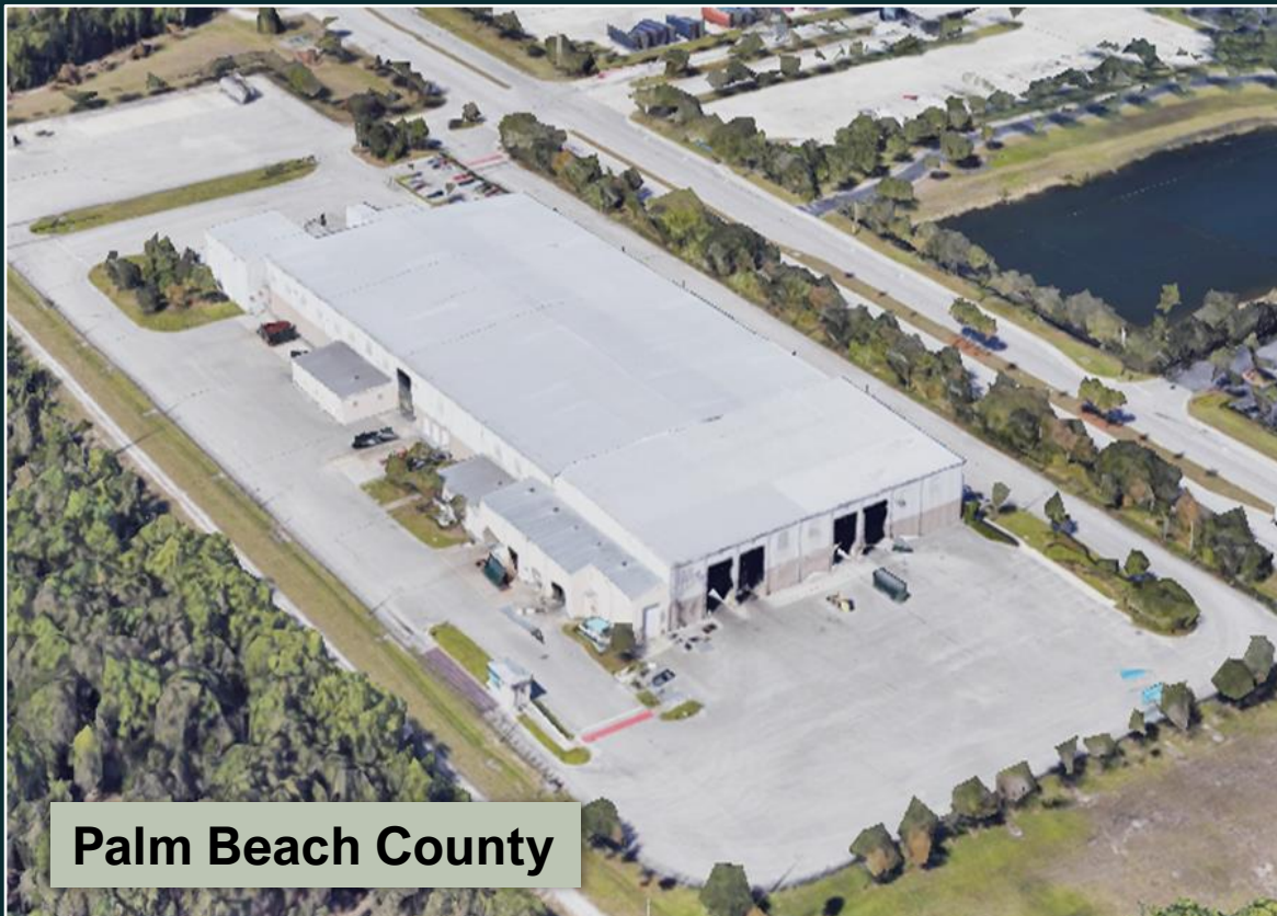
Palm Beach County