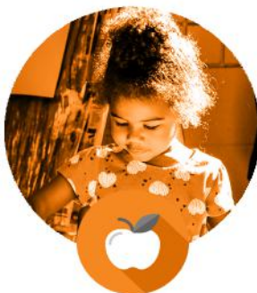
Head Start & after school programs