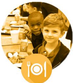
school lunch assistance