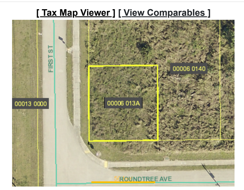
[ Pictometry Aerial Viewer ]