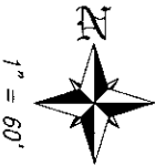
EXHIBIT "A" PG 4 OF 4