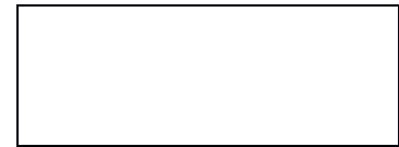
(Affix Corporate Seal, as applicable)

_____ Company Name (Name printed or typed)