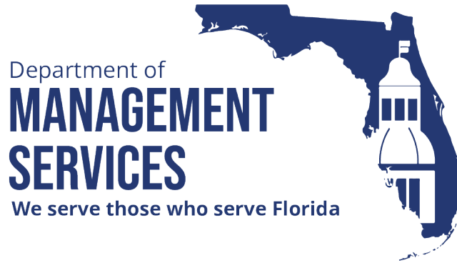
Exhibit B ENTERPRISE STANDARD TERMS AND CONDITIONS

These Enterprise Standard Terms and Conditions set forth the terms and conditions regarding the administration of the Term Contract, including the provision of Products to Customers. Customer specific terms for purchases off this Term Contract shall be set forth in the Customer specific agreement.